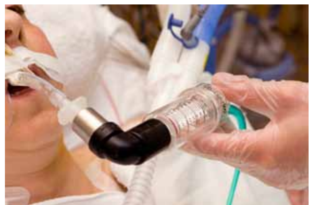
Figure 6. Respiratory muscle resistive training with Threshold loading in a patient weaning from mechanical ventilation

Supported by: this work is partially funded by Research Foundation - Flanders grant G0523.06.