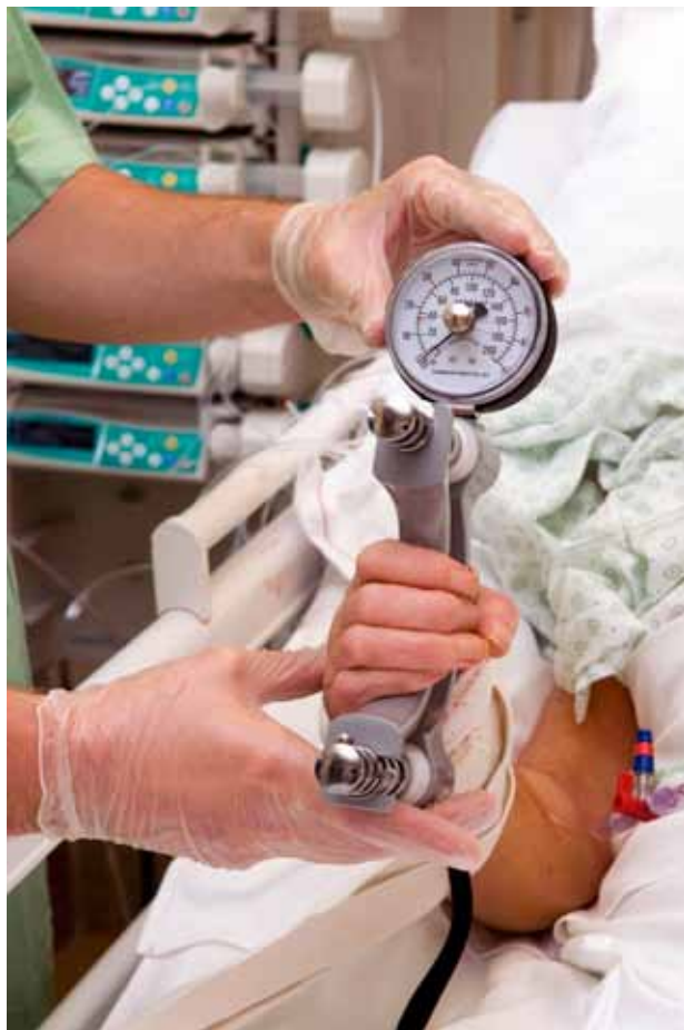
Figure 1. Assessment of muscle strength with a handgrip dynamometer

The risk of moving a critically ill patient is weighed against the risk of immobility and recumbency and when employed requires stringent monitoring to ensure the mobilization is instituted appropriately and safely. Acutely ill, uncooperative patients will be treated with modalities such as passive range of motion, muscle stretching, splinting, body positioning, passive cycling with a bed cycle, or electrical muscle stimulation that will not need cooperation of the patient and will put minimal stress on the cardiorespiratory system. On the other hand, the stable cooperative patient, beyond the acute illness phase but still on mechanical ventilation, will be able to be mobilized on the edge of the bed, transfer to a chair, perform resistance muscle training or active cycling with a bed cycle or chair cycle and walk with or without assistance. The flow diagram 'Start to move' was developed in our center (figure 2), inspired upon the flow diagram by Morris et al. [15], and is an example of a multidisciplinary step-up approach. Six levels are identified and each level defines the modality of body positioning (mobilization) and physiotherapy which are based on assessment of medical condition (cardiorespiratory and neurological status, level of cooperation and functional status (muscle strength, level of mobility). Each day the ICU team defines the 'start to move' level in every patient, especially in those facing an extended ICU stay.