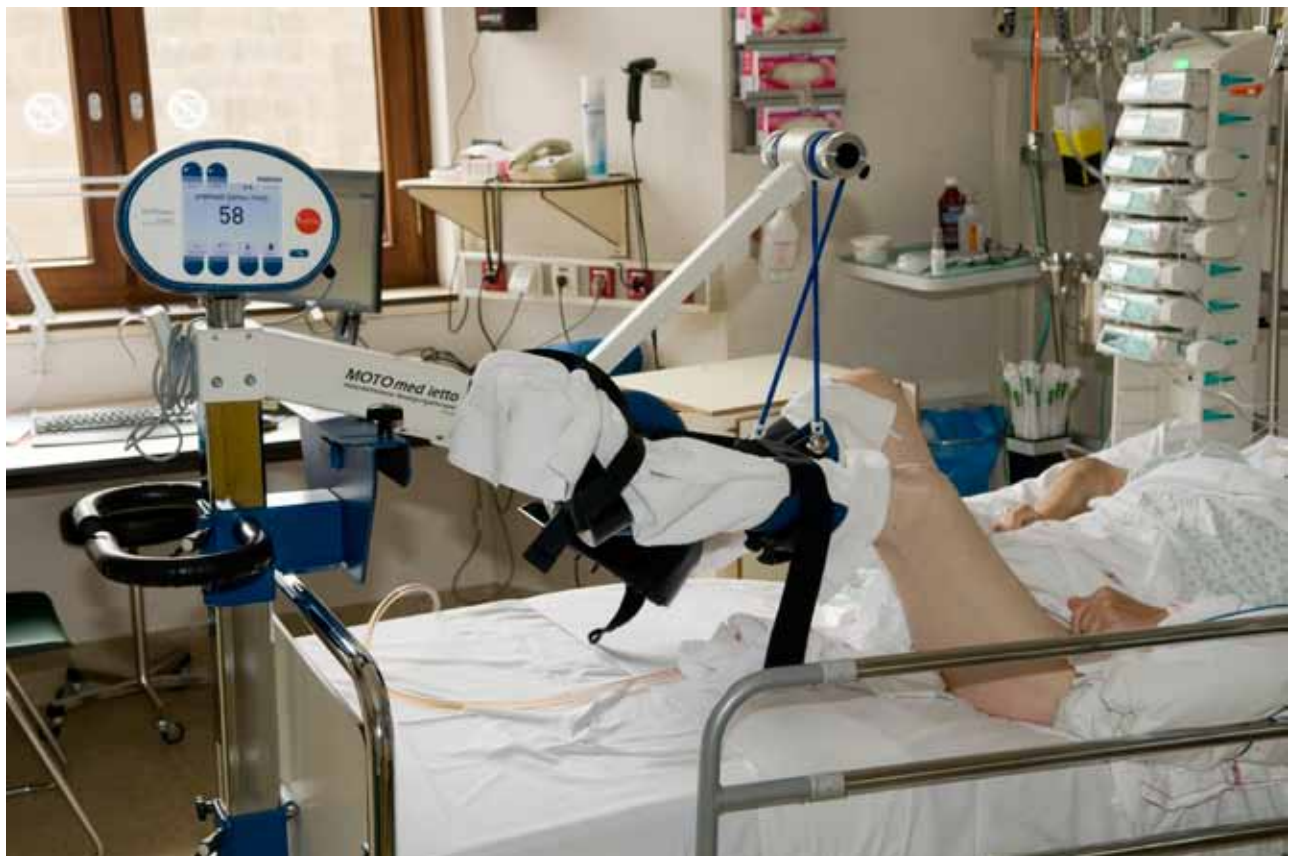
Figure 3a. Device for active and passive cycling in a bedridden patient in the intensive care unit