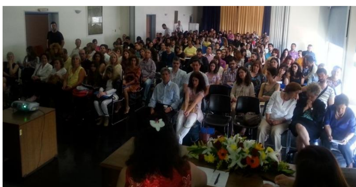
Picture 4. ICU seminar, Athens, Greece.