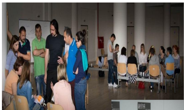
Picture 1. Cardiovascular clinical workshop, Heraklion, Crete, Greece.